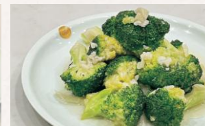
Sauteed Broccoli With Garlic 蒜蓉西兰花 $17.99