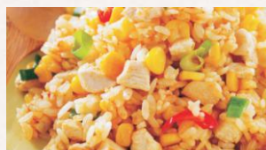
Chicken Fried Rice 鸡丁炒饭 $18.99