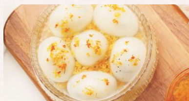
Sweet Sesame Rice Ball in Osmanthus Soup 桂花汤圆 $11.99