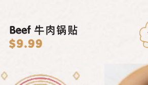
Beef 牛肉锅贴 $9.99