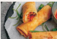
Vegetarian Spring Roll 素春卷(3) $4.99