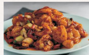
Kung-Pao Shrimp 宫保虾球 $20.99