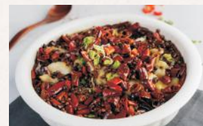
Sliced Fish Filet in Chilli Oil 水煮鱼 $27.99