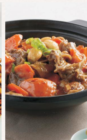
Chinses Braised Beef Brisket With Carrot 萝卜牛腩煲 $20.99