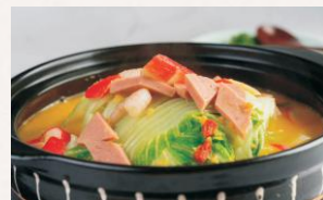
Baby Cabbage in Chicken Soup 上汤娃娃菜 $17.99