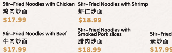
Stir-Fried Noodles with Beef 牛肉炒面 $17.99