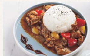
Steamed Rice With Secret Gravy 琼汁捞饭 $19.99