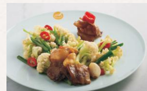
Spicy Stir-Fried Cauliflower 钵子花菜 $17.99