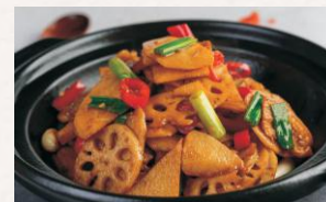
Spicy Stir-Fried Lotus Root and Jicama 钵子双脆 $21.99