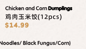
Chicken and Corn Dumplings 鸡肉玉米饺(12pcs) $14.99