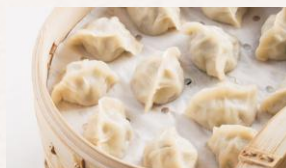
Pork Chives Shrimp Dumplings 韭菜/虾仁/三鲜饺(12pcs) $15.99