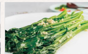
Stir-fried Baby Bok Choy with Garlic 蒜蓉菜心 $18.99