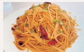
Hot and Sour Shredded Potato 酸辣土豆丝 $17.99