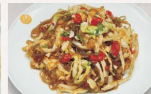
Stir-Fried Cabbage with Glass Noodle 粉丝包菜 $18.99