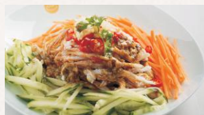
Shredded Chicken with Chilli Sauce 垂涎鸡丝 $8.99