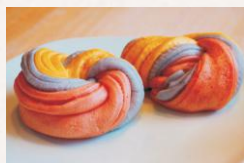
RainBun 彩虹花卷(2) $6.99