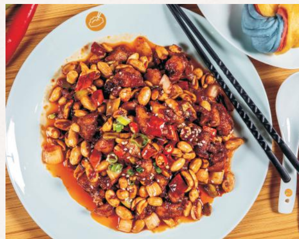
Kung-Pao Chicken 宫保鸡丁 $18.99