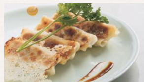
Pot Sticker 锅贴(6 PCS) Pork 猪肉锅贴 $9.99