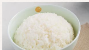
Rice 米饭 $2.99