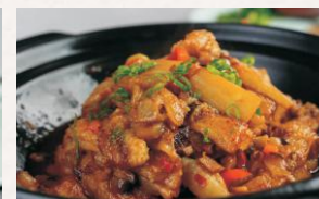
Braised Eggplant with Soy Bean Paste 鱼香茄子煲 $19.99