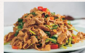
Stir-fried Lamb Slices with Cumin 孜然羊肉 $21.99