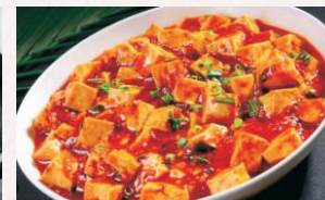
Mapo Tofu 麻婆豆腐 $18.99