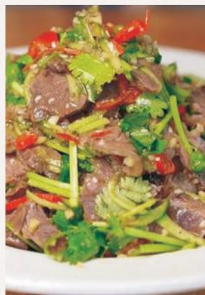
Chili Sauce Pickled Beef 香辣酱牛肉 $9.99