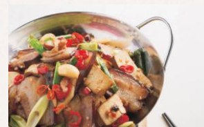
Stir-fried Chinese Bacon With Pepper 湘炒腊肉 $21.99