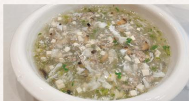
West Lake Beef Soup 西湖牛肉羹 $15.99