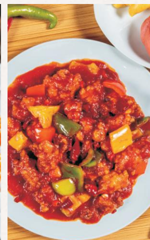
General Tao's Chicken 左宗鸡 $20.99