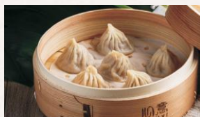
Soup Dumplings (Xiaolong Bao) 小笼包(6pcs) $7.99