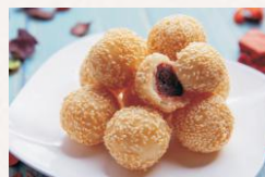
Sesame Mini Ball 芝麻球(4) $4.99