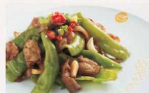
Signature Stir-fried Pork Slices 心意小炒肉 $18.99