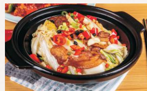
Spicy Stir-fried Baby Cabbage 钵子娃娃菜 $22.99