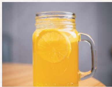
Pop 软饮料 $2.49 (会员) Coke 可乐 Diet Coke 无糖可乐 Sprite 雪碧 Ginger Ale 生姜汽水 Coconut Milk 椰树牌椰汁 $3.99 JDB Herbal Tea 加多宝凉茶 $3.99 Arctic Ocean 北冰洋 $3.99