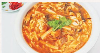
Hot and Sour Soup 酸辣汤 $15.99