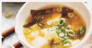
Miso Soup 味噌汤 $3.99