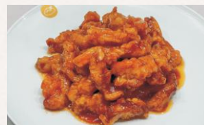
Sweet and Sour Pork 糖醋里脊 $18.99