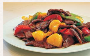
Black Pepper Beef Tenderloin 黑椒牛柳 $20.99