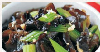
Celery and Black Fungus Salad 芹菜木耳 $6.99