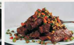
Fried Pork Ribs with Cumin 孜然排骨 $20.99