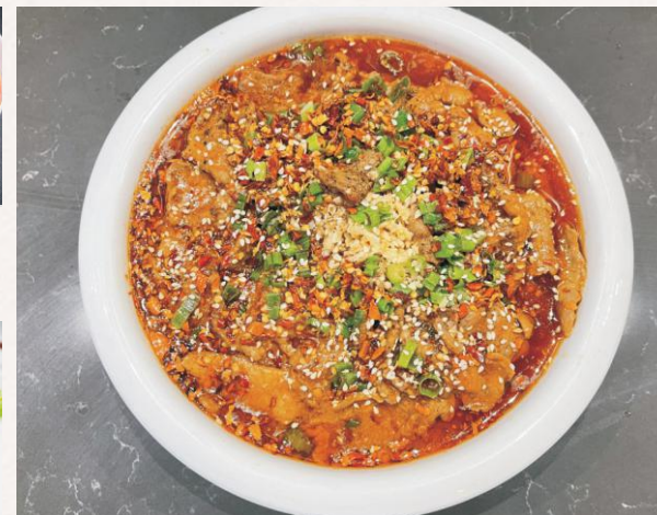
Boiled Beef Slices in Chili Sauce 水煮牛肉 $23.99