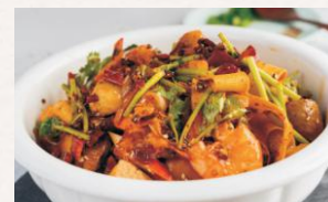
Hot and Spicy Pot 麻辣香锅 $27.99