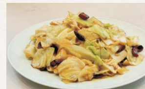
Stir-fried Cabbage 炆炒卷心菜 $17.99