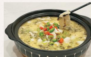
Stewed Fish Filet in Pickled Chinese Cabbage 酸菜鱼 $21.99