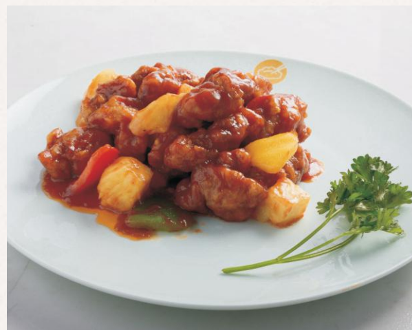
Sweet and Sour Pork 咕咾肉 $18.99