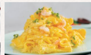
Scrambled Egg with Shrimp 滑蛋虾仁 $19.99