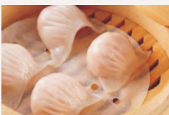
Shrimp Dumplings 虾饺(4) $8.99