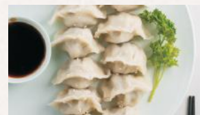
Beef and Onion Dumplings 牛肉洋葱饺(12pcs) $15.99