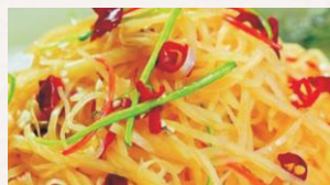
Shredded Potato Salad 炆拌土豆丝 $6.99