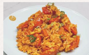
Scrambled Egg with Tomato 番茄炒蛋 $17.99