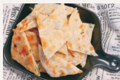
Green Onion Pancake 葱油饼(1) $5.99