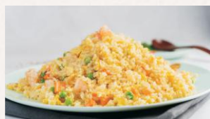
Yangzhou Fried Rice 扬州炒饭 (shrimp, corn, carrot, pea, egg) $18.99