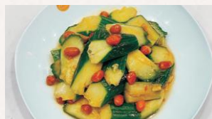
Smashed Cucumber Salad 爽口青瓜 $6.99