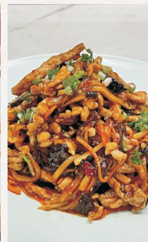
Yu-Shiang Shredded Pork 鱼香肉丝 $18.99