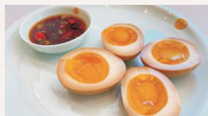
Soft-boiled Spiced Eggs 心意溏心蛋(2) $4.99