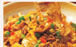
Stir-Fried Egg with Chili Pepper 农家一碗香 $18.99