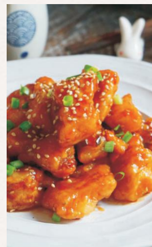
Sweet and Sour Fish Filet 咕咾鱼片 $20.99