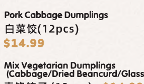
Pork Cabbage Dumplings 白菜饺(12pcs) $14.99