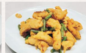
Salt and Pepper Pork Tenderloin 椒盐里脊 $18.99