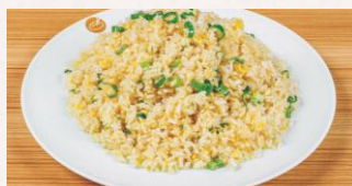
Egg Fried Rice 蛋炒饭 $17.99